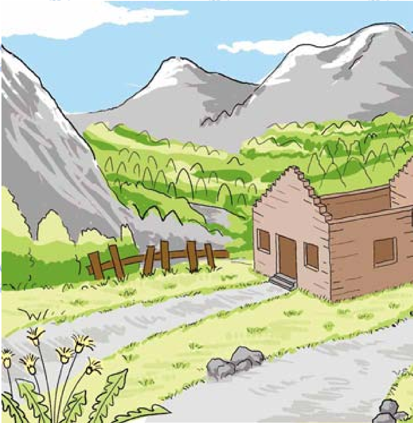
Xiaolong's granddad lived in the mountains.